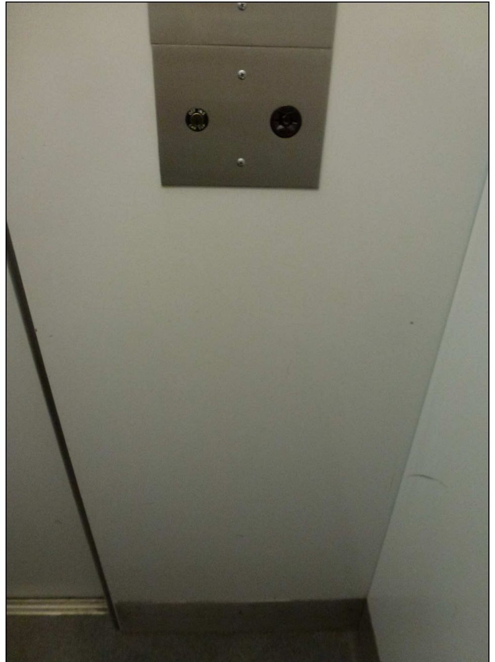
08. Emergency Intercom