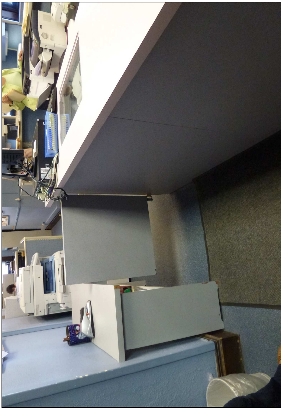
04. Courthouse Office