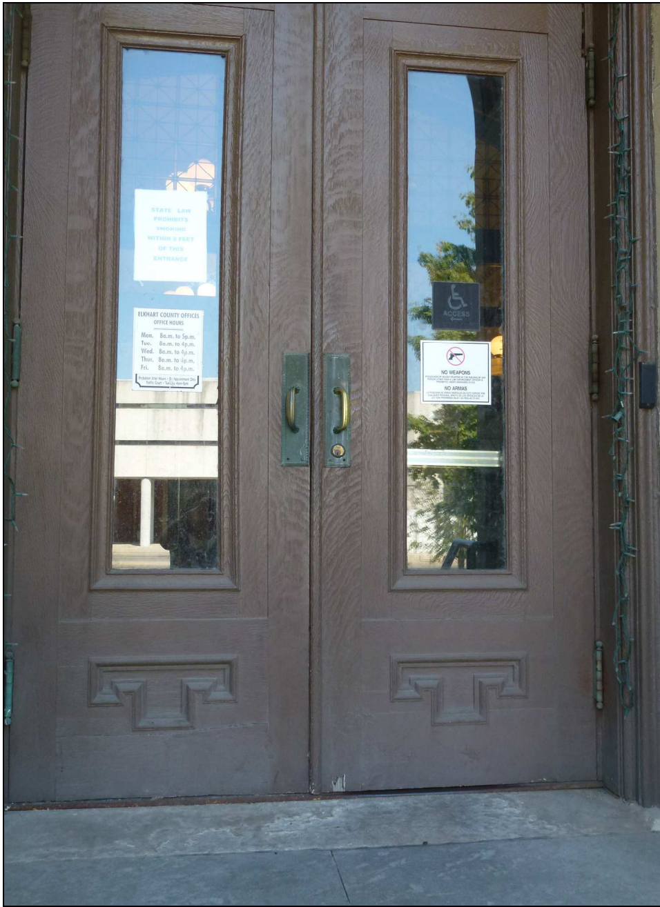
01.Courthouse Front Entrance