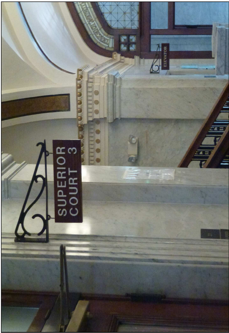
03. Courthouse Interior