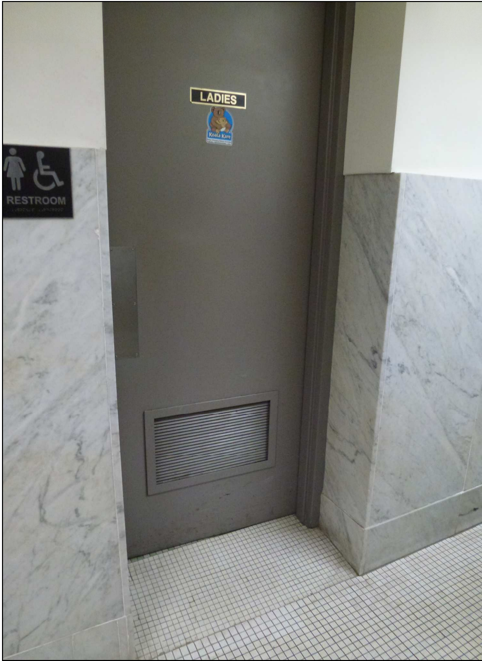
09.Courthouse Restroom Entrance