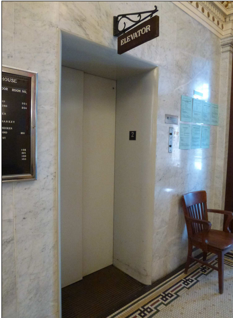
07. Courthouse Elevator