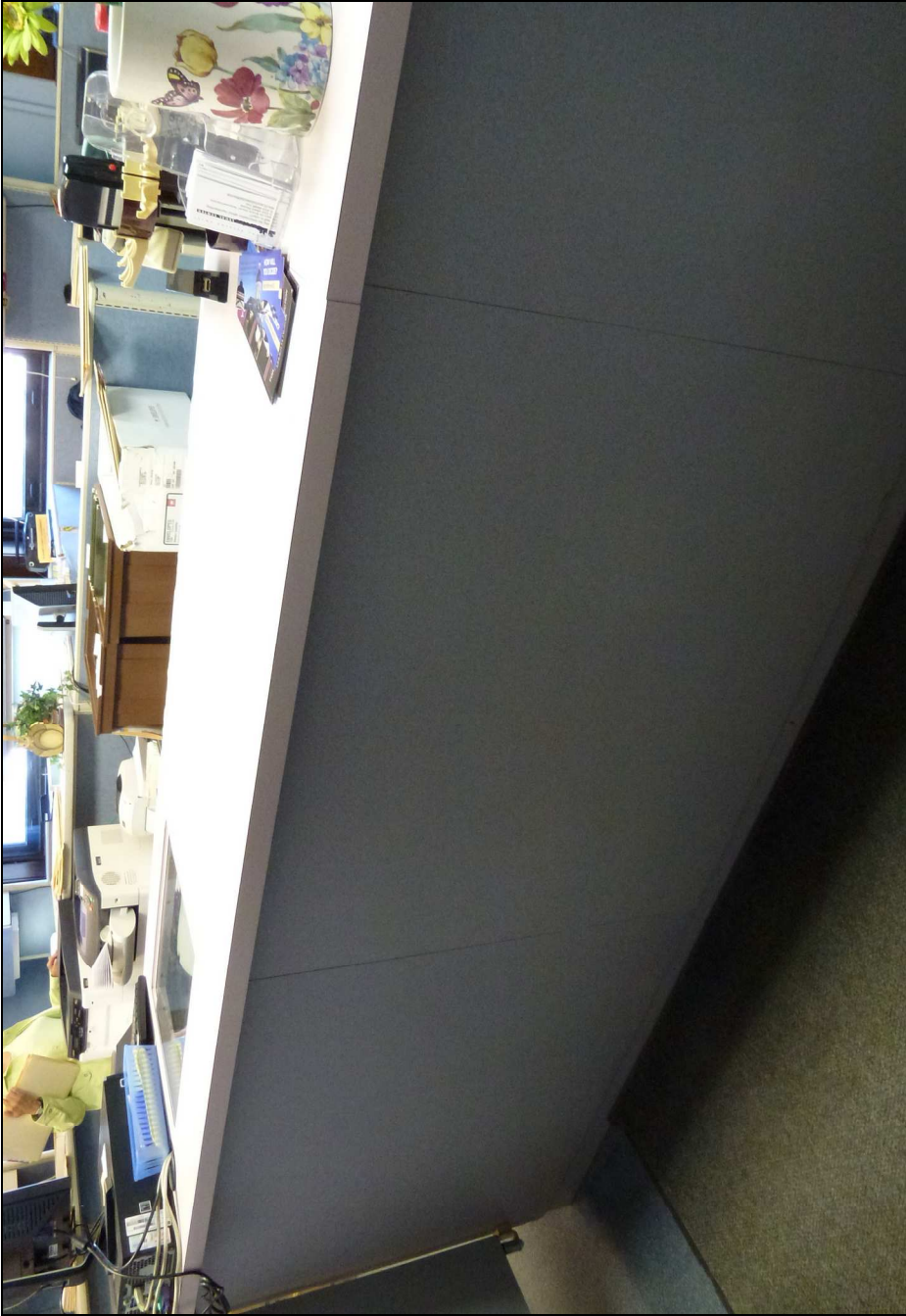
05. Courthouse Counter