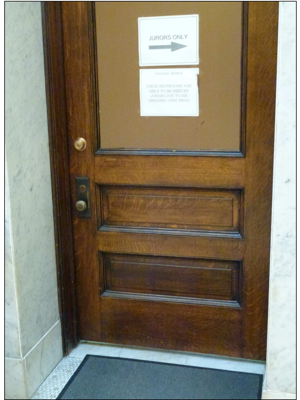
02.Courthouse Interior Door