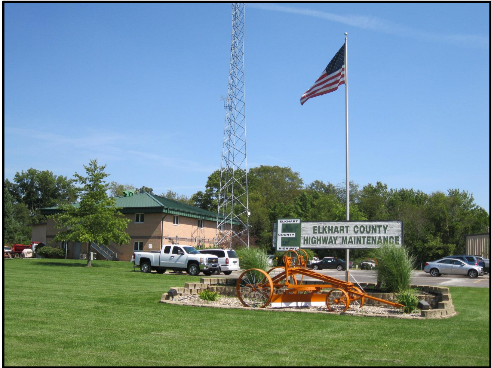
Highway Department 610 Steury Avenue Goshen, Indiana 46528