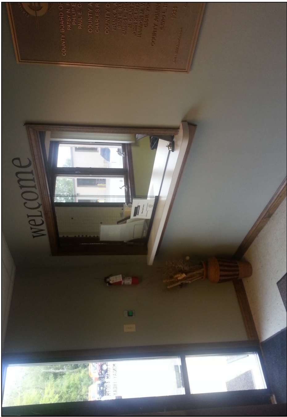
3. Highway Counter