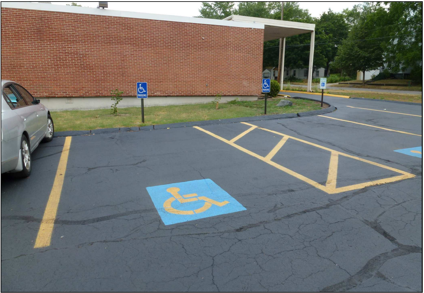
01. Hudson Clinic Accessible Parking