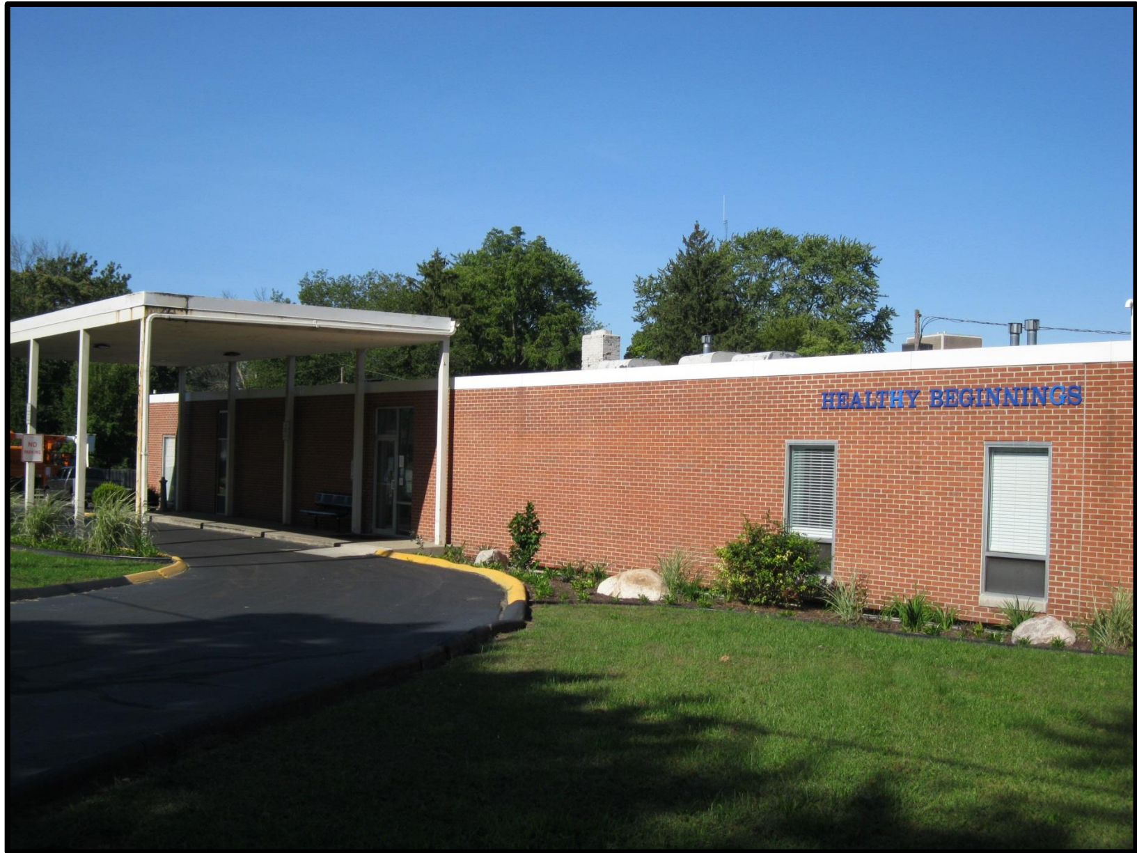
Hudson Clinic 1400 Hudson Street Elkhart, Indiana 46516