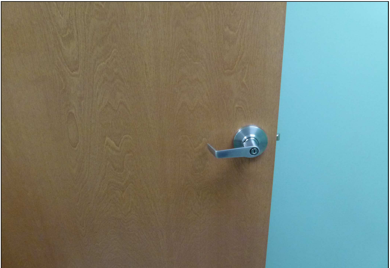
03. Hudson Clinic Accessible Door Knob in Dentist