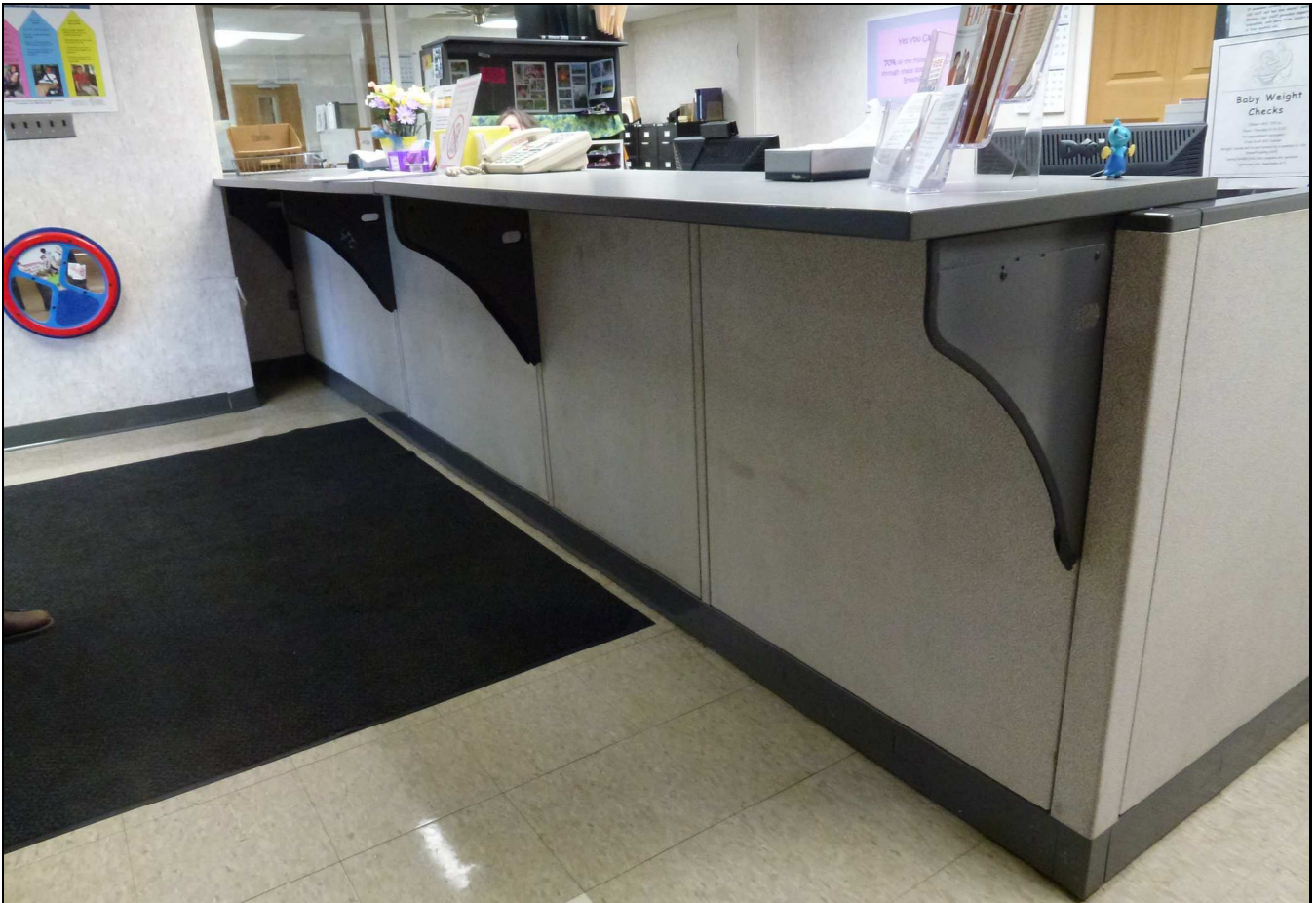
02. Hudson Clinic Counter