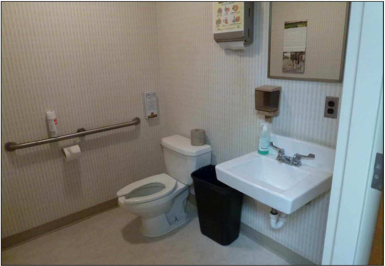
05. Hudson Clinic Accessible Restroom