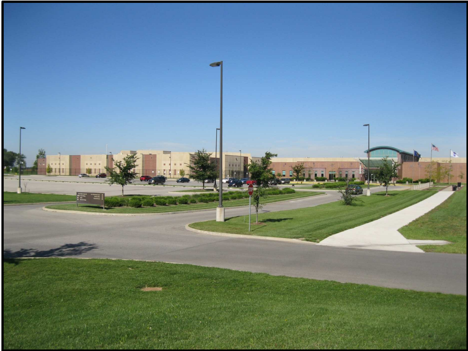
Elkhart County Jail 26861 County Road 26 Elkhart, Indiana 46516