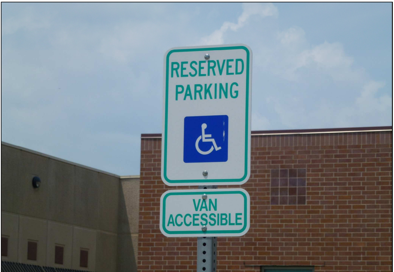
01. Jail Accessible Parking Signage