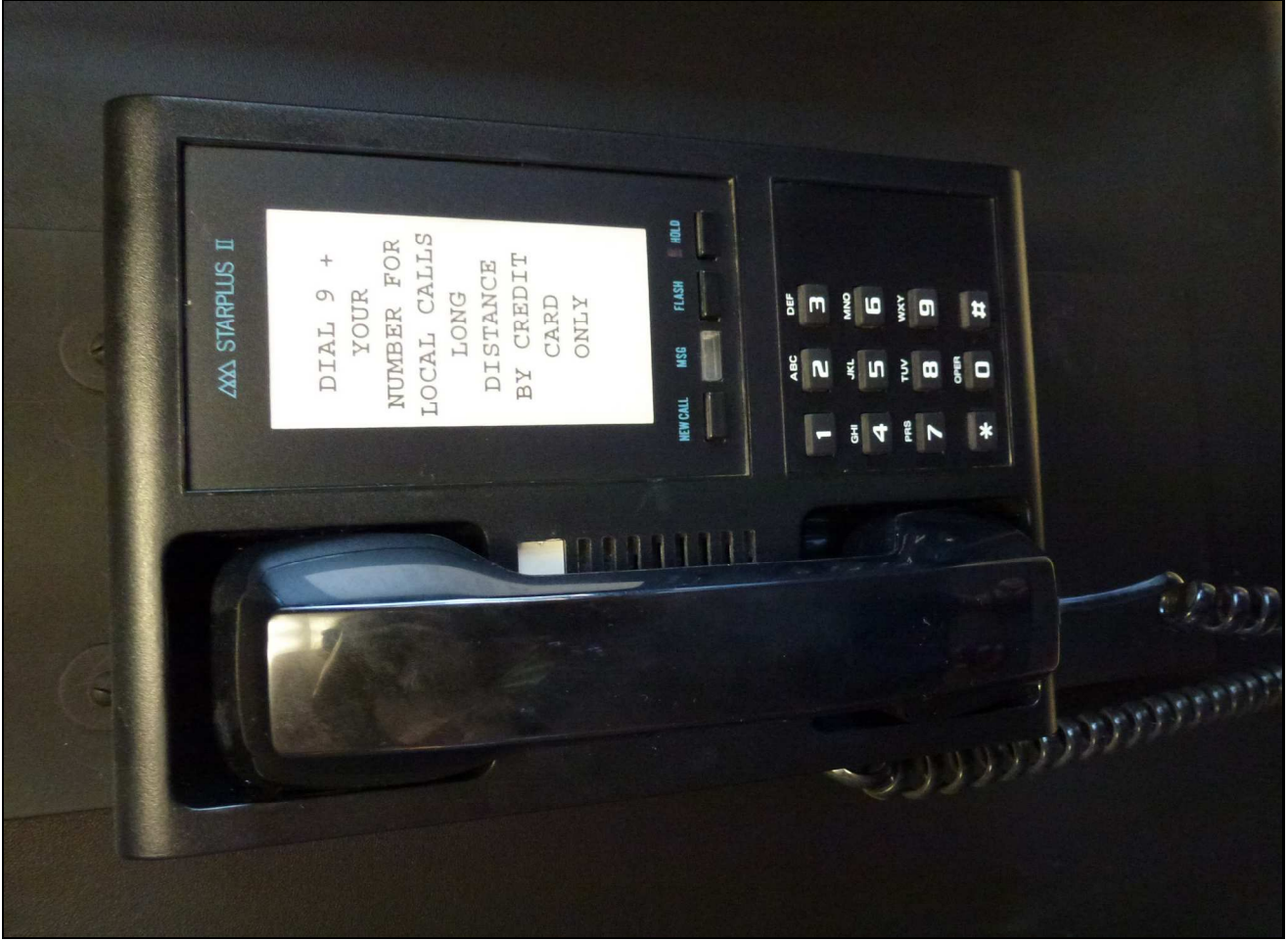
04. Public Services Phone