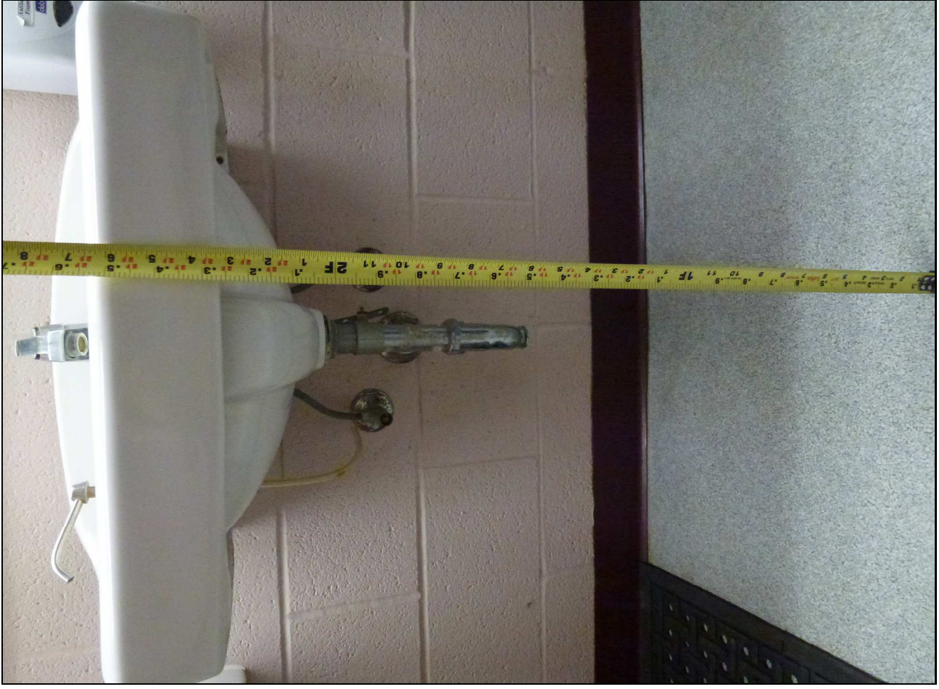
03. Public Services Lavatory