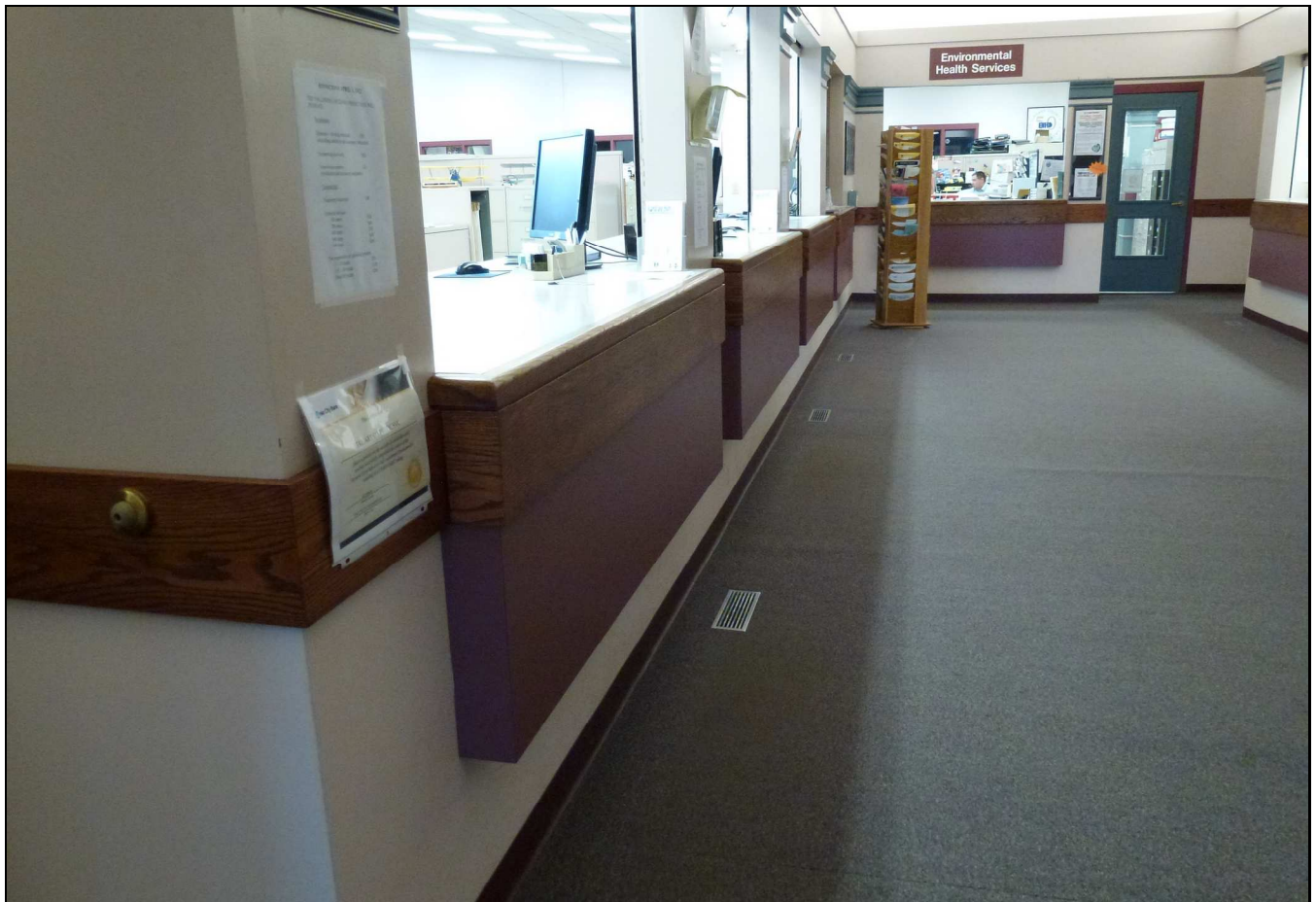
02. Public Services Counters (2)