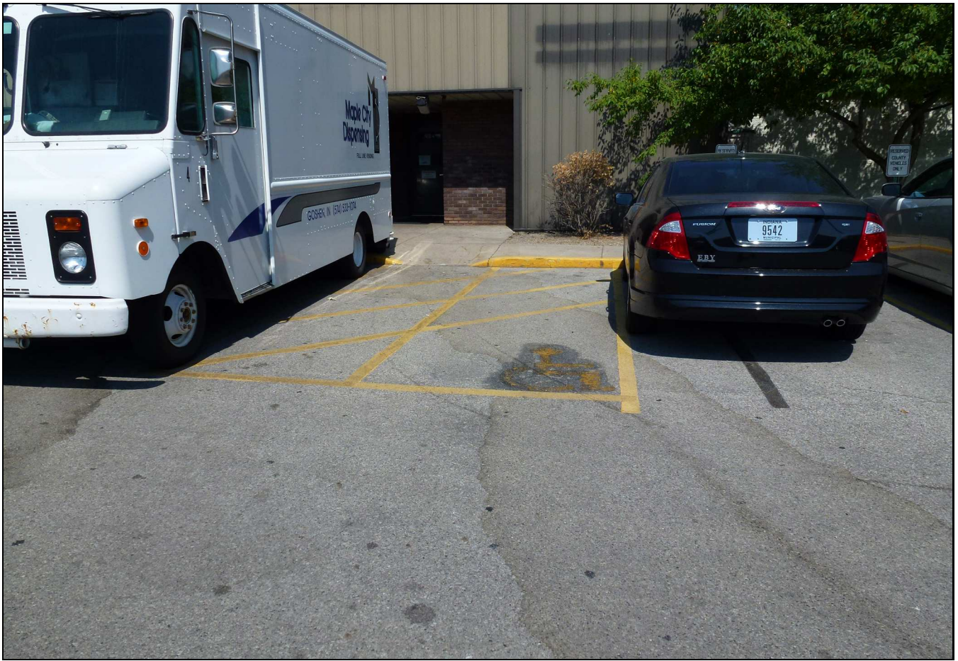
01. Work Release Parking