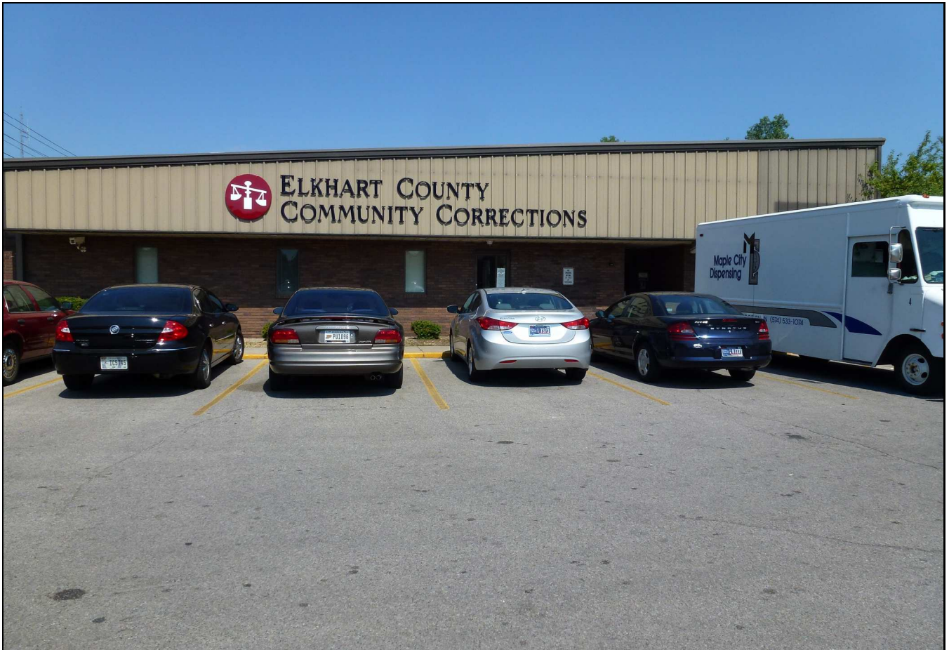
02. Work Release Parking (2)